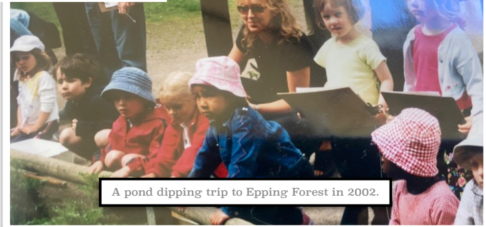
A pond dipping trip to Epping Forest in 2002.

“The teachers are incredible. They truly care about the children and make learning fun every day. Our son’s confidence and social skills have improved so much since joining Walthamstow Montessori”