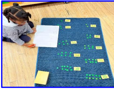
Roman categorising odd and even numbers