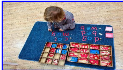
Theo building words with our Large Movable Alphabet

This week we will be learning more about Climates in Europe. We will be looking at the five main climates and identifying areas in Europe that are warmer and colder. Our phonetic sound for the week is 'b'.