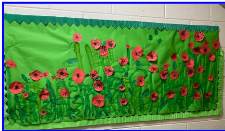
Beautiful display by our Children's House children

soldiers who fought and died in war. Poppies were chosen as a symbol because they often grew in the battlefields after the soldiers stopped fighting. On Friday we observed a 2-minute silence. We were very proud of all our children who showed their respect at 11am to remember and honour those who have made sacrifices for the country. A gentle way of introducing younger children to the concept of remembrance.