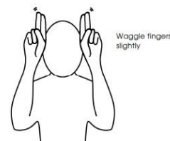
Wiggle fingers slightly