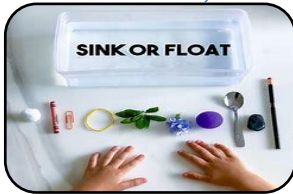
Physics & exploring buoyancy