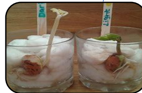
Seed germination in different environments