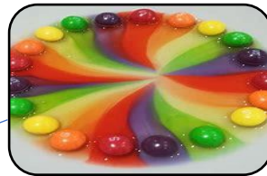
Dissolving & colour mixing