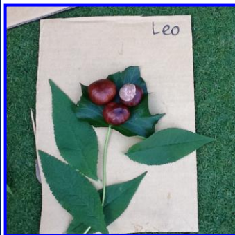
A lovely collage by Leo made from natural objects sourced from the garden.

We will all have a chance to practice our teeth cleaning on a set of model teeth that we have at school. The end of the week will see us start talking about Harvest Festival and what it represents.