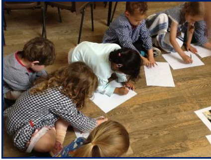
Kandinsky still drawing while listening to music.