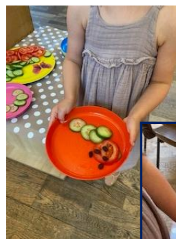
The children prepared their caterpillar snack, with cucumber, tomatoes and raisins.

This week, we will continue with our travels, visiting North America. We will start by exploring Mexico and learning all about this country. Children will look at Frida Kahlo's work and explore this art technique by creating self-portraits. We will then visit Canada and learn its main features as well as the national flag and its meaning. Children will have an opportunity to learn about Canada's endangered animals. We will finish the week by acknowledging and preparing for Father's Day.