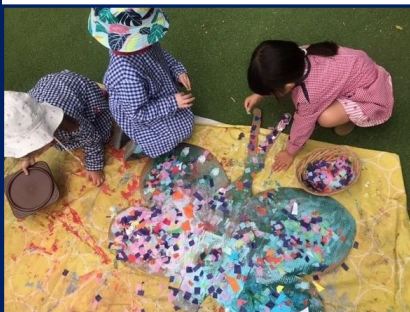
The children created a beautiful butterfly collage.

This week Oak class children will be learning about North America.