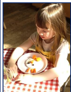
The letter of the week is g and the country of the week is Greece.