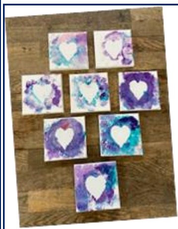
Heart Canvases made by Willow Class