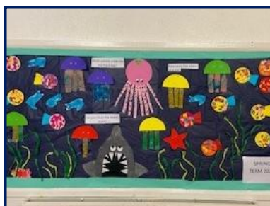
Oak Class Spring Term Display Board