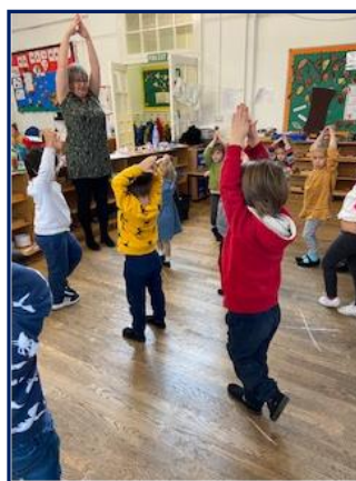
Yoga - Tree Pose