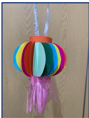
Diya Diwali Lantern

For our DT session children made some lanterns to commemorate Diwali, a Hindu festival of new beginnings and the triumph of good over evil, and light over darkness. Children took the opportunity to think about what "happiness" is and what makes them happy.