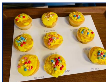
Our yummy 'Children in Need' fundraising cakes!

On Friday the children had a fun day for Children in Need, we all dressed in spotty clothes! We talked about the charity 'Children in Need', and the important children charities that they support. The children had fun all together in our disco party! and decorated some delicious cakes.