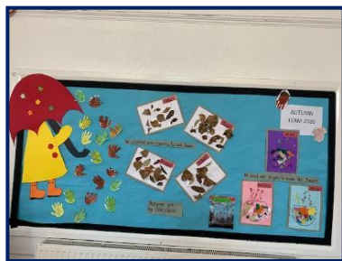
Oak class Autumn Display Board