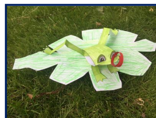
A Green Tree Frog

Other children made a Green Tree Frog. The Green Tree Frog is a frog which lives in a rainforest in Australia. Unlike our usually brown earthy frogs this particular one is a vivid green. With its long legs the frog loves to jump from leaf to leaf.