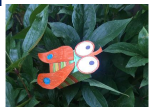
A Fly Box