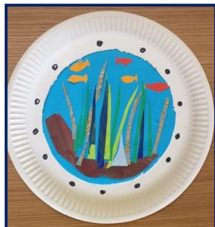
We created our paper plate port holes, creating a colourful under the sea collage.

The Nursery children enjoyed learning about sea creatures through a variety of interesting activities. On our zoom session on Monday, we looked at the classified cards of sea animals and learned to identify and name them.