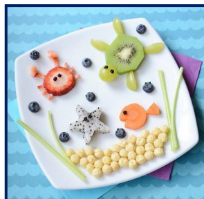
On Friday we created some sea creature snacks and had a lovely dancing party.

On Thursday the children learnt about the body parts of an octopus and created an octopus collage. We sang "The Slippery fish" and "The Pirate ship" songs together and we watched an animated version of the story "Who sank the boat?".