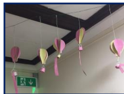
Little hot air balloons by Reception Class based on Dr Seuss- 'Oh the Places You'll Go!'

Each child wrote and attached their very own wish of a place where they would like to go to.