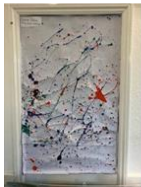
In art, Acorn class created this piece of work inspired by Jackson Pollock using his 'Drip paint technique'.

This week, the children will have an opportunity to explore world music and folk dances. They will learn about Flamenco and create a clothespin Flamenco dancer, they will step dance to Irish music, learn about Russian music, dance to tango and explore the African folk dance. There will be various art activities, music and dance to support these lessons.